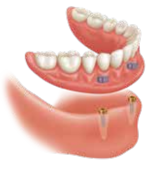
Overdenture LOCATOR Root $1,805-$3,061