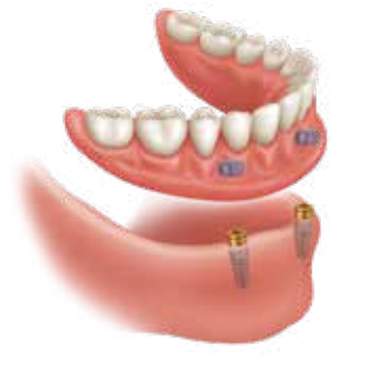
Retro-fitted Overdenture LOCATOR Removable with LOCATOR Implants $6,743-$6,698